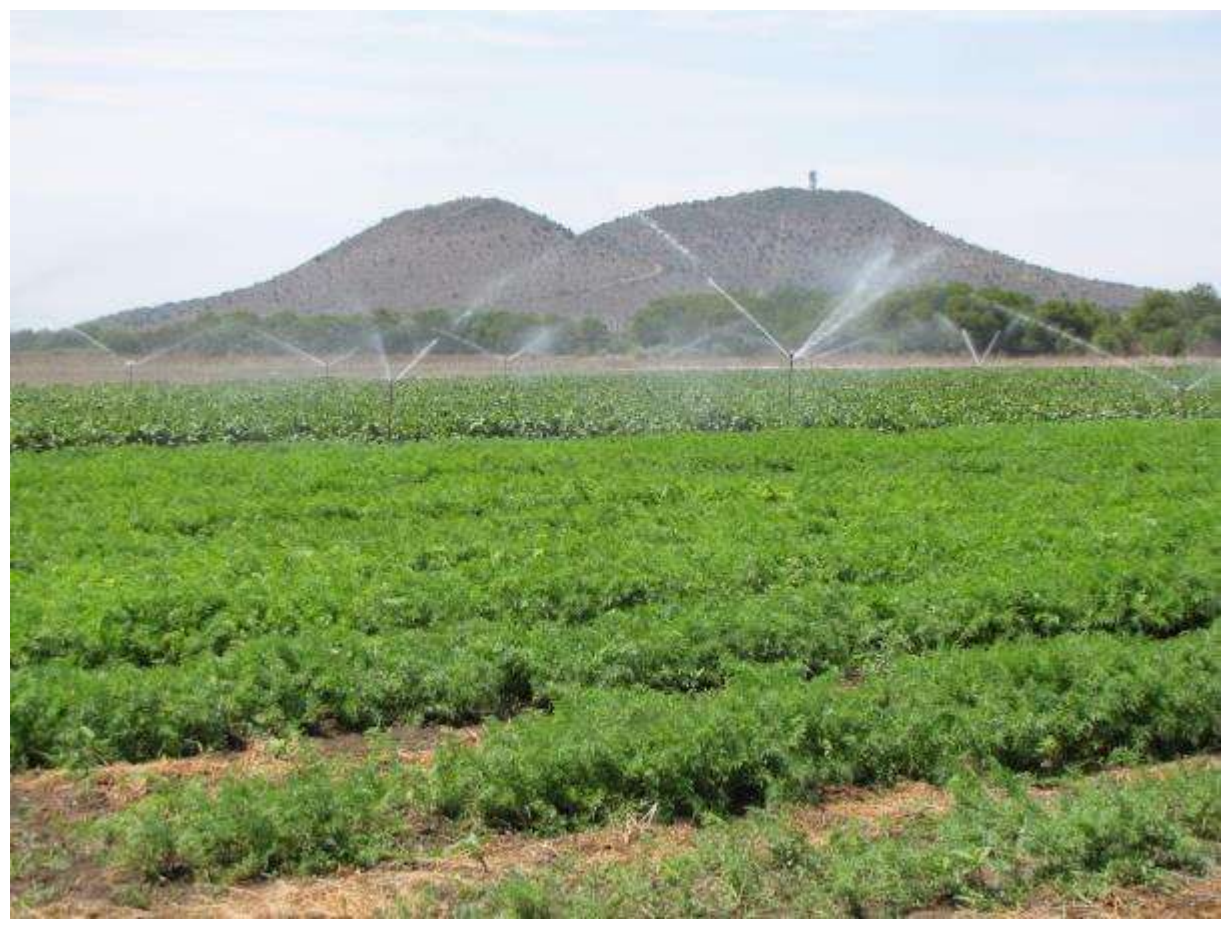
Production of organic carrots, beetroots and potatoes